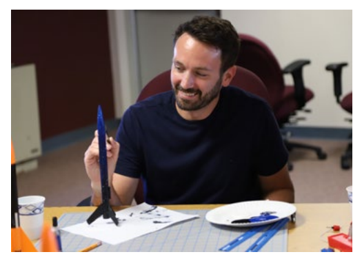
Rocket painting.