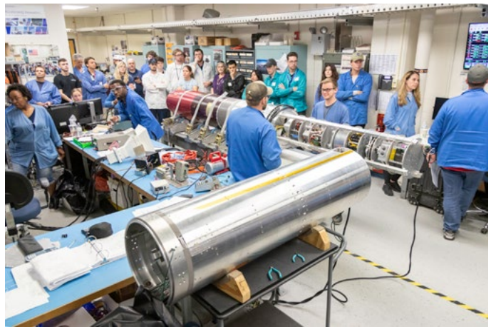
RockSat–X sequence testing.