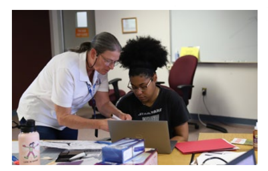
Rocket construction.