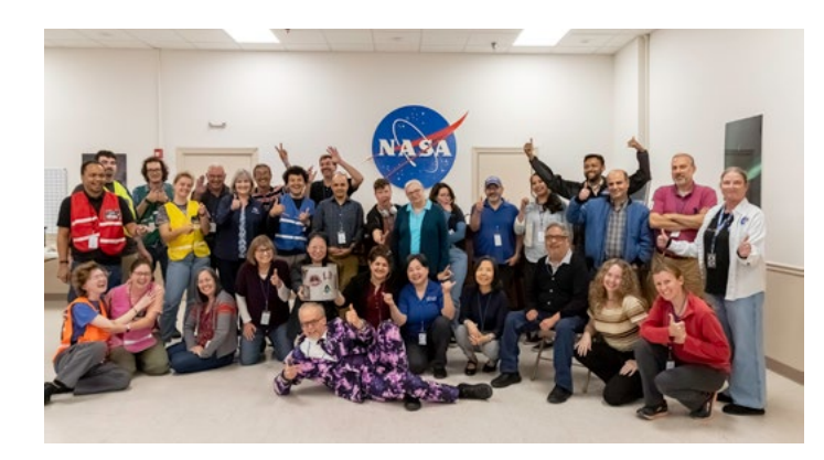
Minority Serving Institutions (MSI) faculty at RockOn workshop at Wallops.