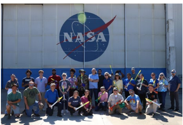
WRATS group photo after the final launch.

"Rocketry is more exciting than I thought."