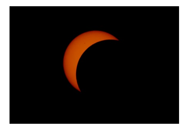
The Sun eclipsed as seen from Wallops Island, VA.