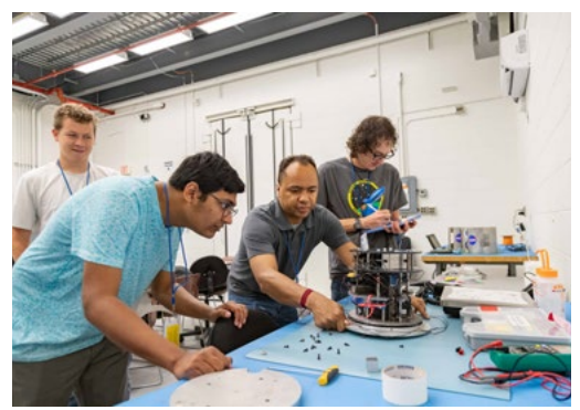
RockSat–C pre–integration checks.