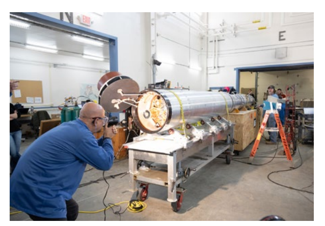
FOXSI 4 pre-flight testing.