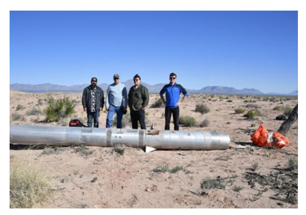
CIBER-2 recovery operations.