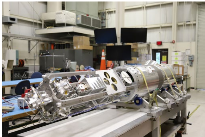
TOMEX Plus instrumented payload.

RockSat–X is the most advance in a series of student flight opportunities. RockSat–X provide access to the space environment, i.e. the payload skirt is deployed and the experiments are exposed to the vacuum and radiation of space. Students design and build their own experiments and the payload includes standard support systems, such as, telemetry, attitude control, and recovery. Nine Colleges and Universities are flying experiments in 2024 and the launch is currently scheduled for August 13, 2024 from Wallops Island, VA.