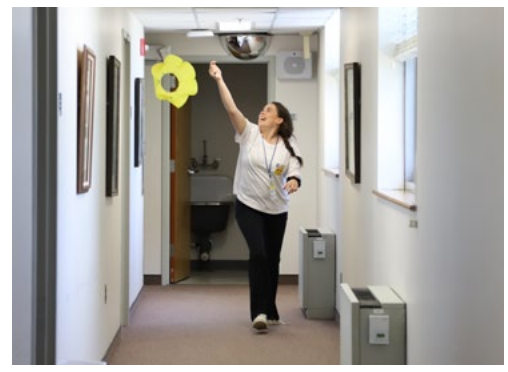
Parachute testing.